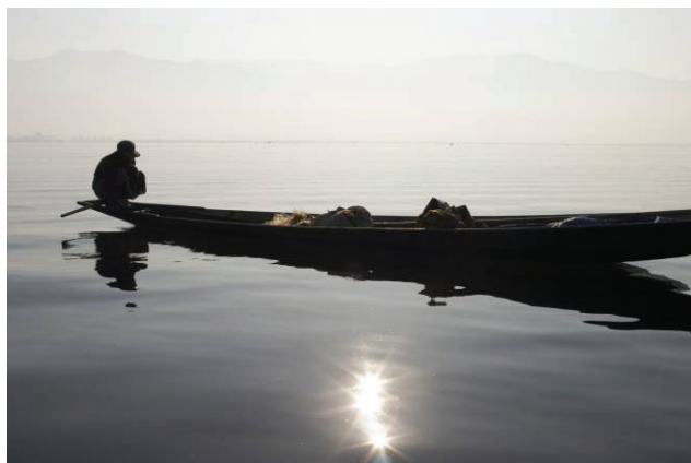
Planned development projects in the Mekong River basin will have significant transboundary impacts on the environment and river livelihoods, and may lead to regional conflict.

IMPLEMENTING PARTNERS AECOM, The Asia Foundation, U.S. Environmental Protection Agency, Mekong River Commission.