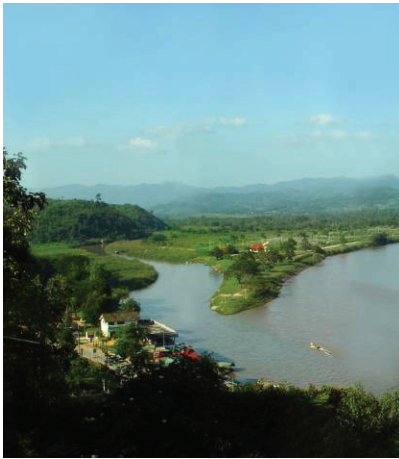
Through ECO-Asia, USAID works in target watersheds to demonstrate innovative approaches addressing transboundary conflicts.

BACKGROUND As the Mekong sub-region develops, riparian countries have been constructing dams, dikes and irrigation, and navigation waterways that significantly impact river livelihoods. A major challenge for Mekong River countries is the adoption and implementation of policies and practices that enable participatory and collaborative engagement for planning and development that support sustainable development that both protects vital ecosystems and promotes economic and social prosperity, while ensuring prevention, management and mitigation of conflict.